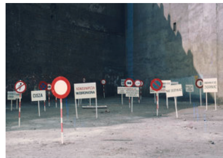
Legality of Space.

In 1980 Partum announced that she would always perform naked, since there was no place for women in art and art history except for as a model or an artist’s wife;