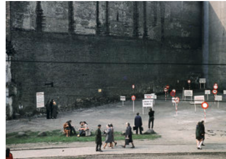
Legality of Space.