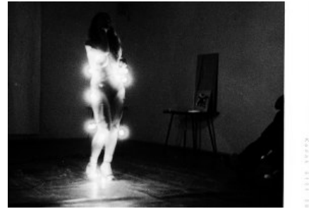
Stupid Woman . Courtesy of ARTUM Foundation Ewa Partum Museum

which the artist, naked, wearing only red lipstick and high heels performs a “stupid woman” – frivolous and flirtatious, dancing and laughing, impersonating the slightly degrading stereotype of a party-girl devoid of seriousness and conduite . After 45 minutes, the artist officially thanks her audience, terminates the performance and leaves. Adorno once depicted the women's situation in patriarchal culture as “the reverse